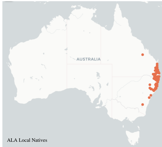
ALA Local Natives