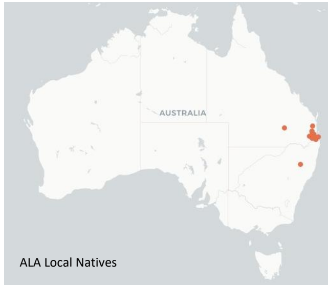
ALA Local Natives

Oleaceae Notelaea lloydii Vulnerable lloyd's mock-olive