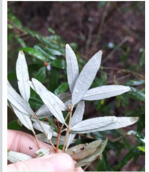
Liz Snow iNat