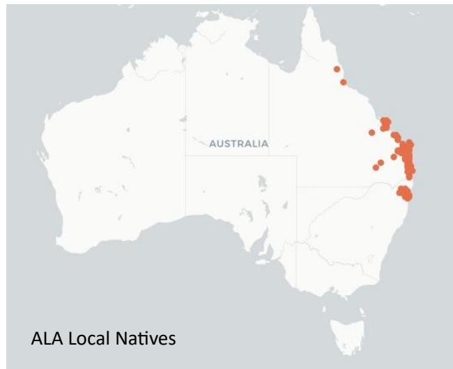
ALA Local Natives