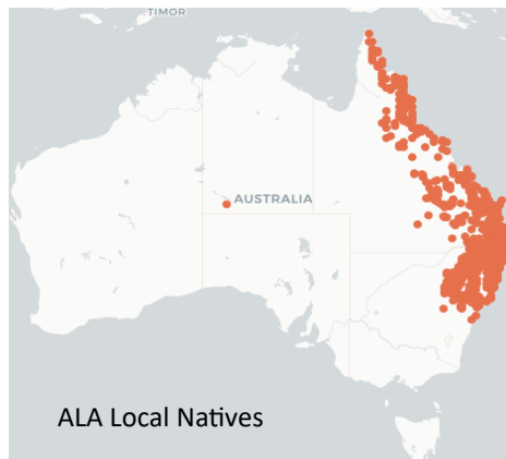
ALA Local Natives