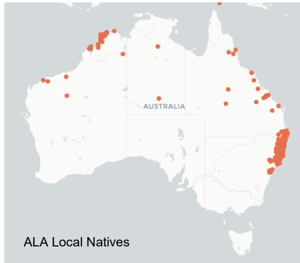
ALA Local Natives