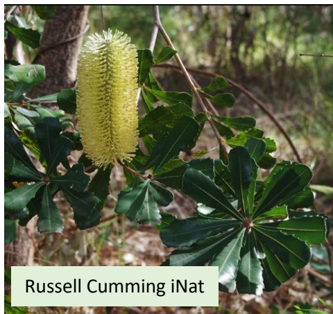
Russell Cumming iNat