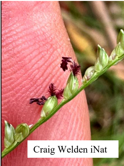
Craig Welden iNat