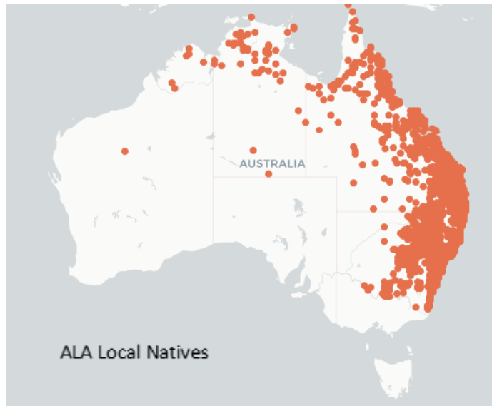
ALA Local Natives